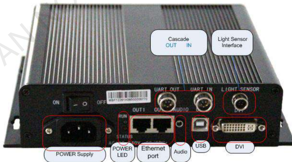
Fig. 2 Interface diagram